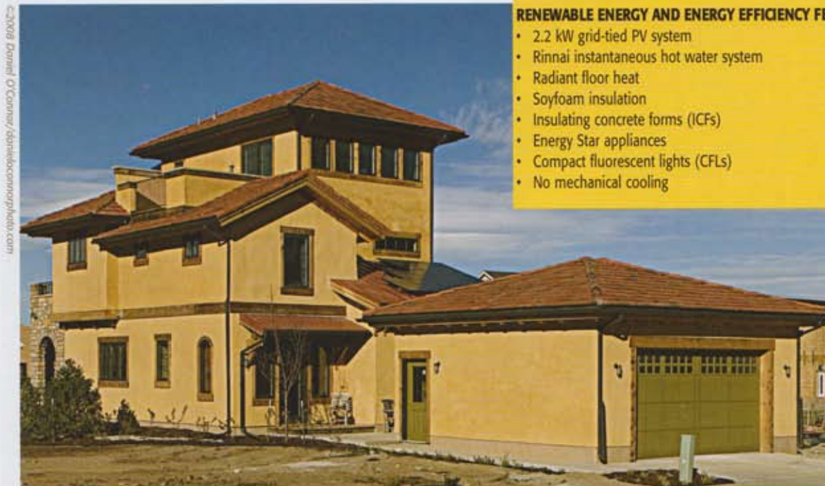
Merten Homes' new straw bale home in Old Town North in Fort Collins boasts R-28 walls, R-72 ceilings, and a 2.2-kilowatt grid-tied solar electric (photovoltaic or PV) system.