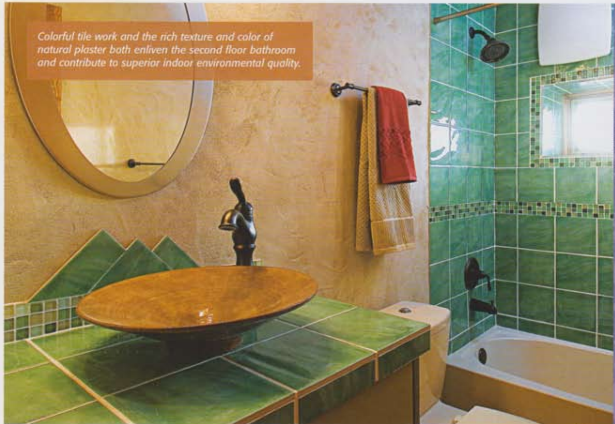
Colorful tile work and the rich texture and color of natural plaster both enliven the second floor bathroom and contribute to superior indoor environmental quality.